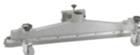
Wet Floor Nozzle - Fixed